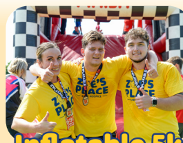
Inflatable 5k July 26th