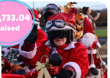
Boundary 500 Santa Ride

In November 2024, 160 motorcycles and 225 participants took to the streets of Teesside in the 22 mile motorbike ride! Spectators a plenty, this much-loved event holds a special place in the hearts of many.