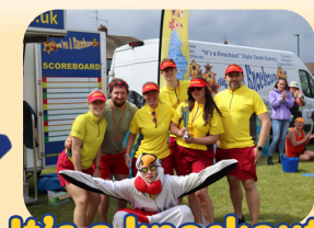
It's a knockout June 21st