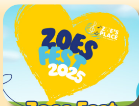
Zoes Fest June 28th