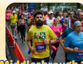
Middlesbrough 10K August 31st